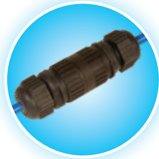
In-Line Quick Connect