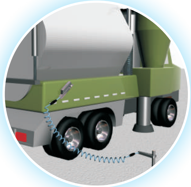
Bonding a Vacuum Truck to Grounding Rod

The Bond-Rite EZ is especially useful in situations requiring temporary or emergency static grounding, where it is not practical to connect to a permanent grounding system, but where safety procedures or guidelines require that bonding and grounding connections must be tested and verified.