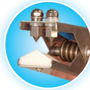
Tungsten Carbide Tips